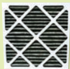
Part - AN4038