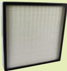
Part - AN4701