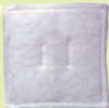
Part - AN4036